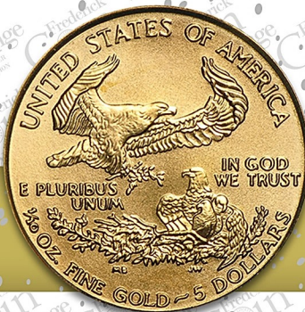
1/10 th oz American Gold Eagles