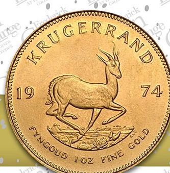
1oz South African Krugerrands

Ask about bulk pricing deals. Please note premiums and buy prices are subject to change.