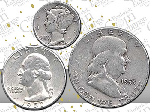
*90% Silver "Junk Silver"