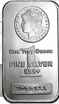
1oz Silver Bars