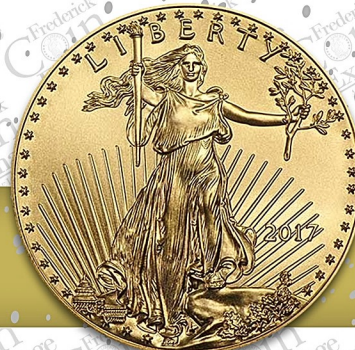
1oz American Gold Eagles