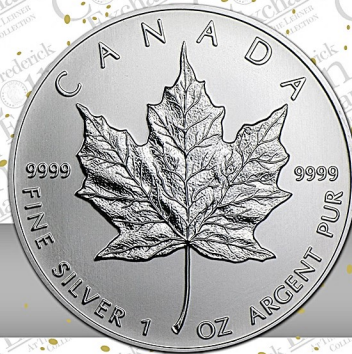
1oz Canadian Maple Leafs