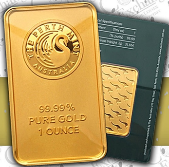
1oz Gold Bars