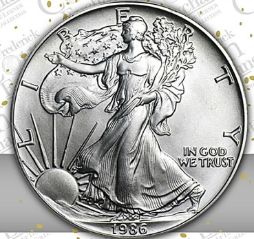
1oz American Silver Eagles

*90% Silver is United States coinage including dimes, quarters and half dollars made before 1965. Our ratio uses 715 troy ounces as the net silver weight of a $1000.00 Face Bag.