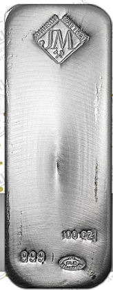
100oz Silver Bars