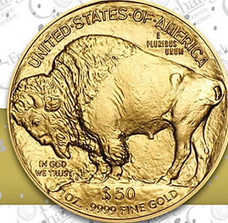
1oz American Buffalos