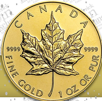
1oz Canadian Maple Leaf