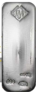
100oz Silver Bars