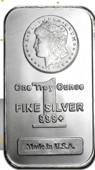
1oz Silver Bars