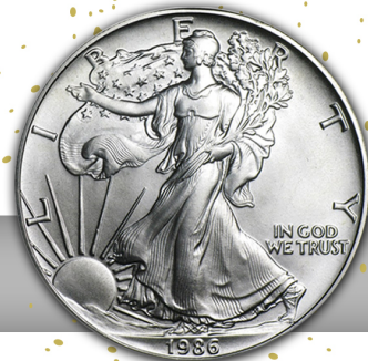
1oz American Silver Eagles

*90% Silver is United States coinage including dimes, quarters and half dollars made before 1965. Our ratio uses 715 troy ounces as the net silver weight of a $1000.00 Face Bag.