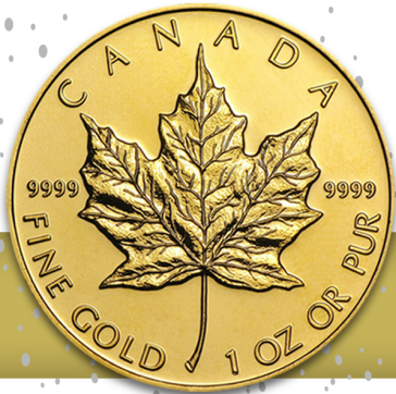
1oz Canadian Maple Leaf