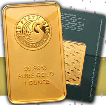
1oz Gold Bars