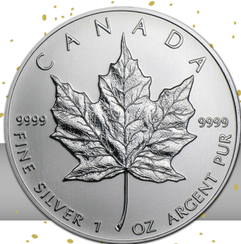
1oz Canadian Maple Leafs