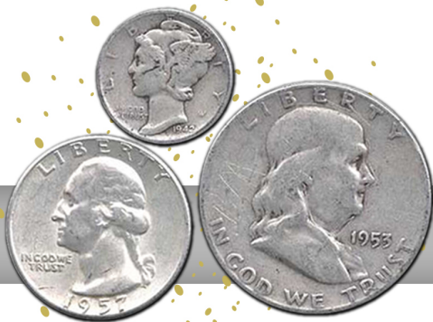
*90% Silver "Junk Silver"