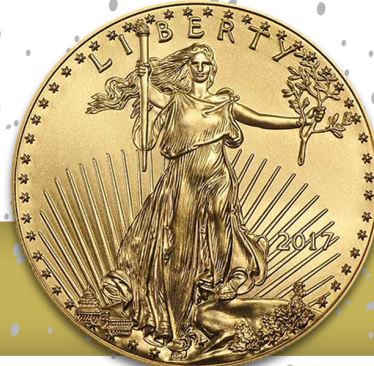
1oz American Gold Eagles