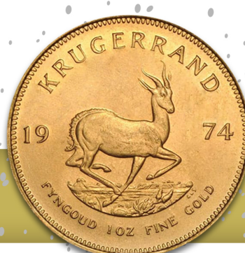
1oz South African Krugerrands

Ask about bulk pricing deals. Please note premiums and buy prices are subject to change.