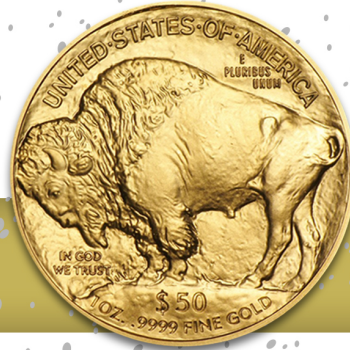
1oz American Buffalos