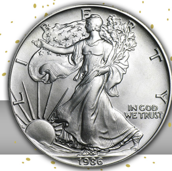
1oz American Silver Eagles

*90% Silver is United States coinage including dimes, quarters and half dollars made before 1965. Our ratio uses 715 troy ounces as the net silver weight of a $1000.00 Face Bag.