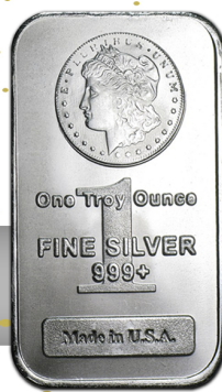
1oz Silver Bars