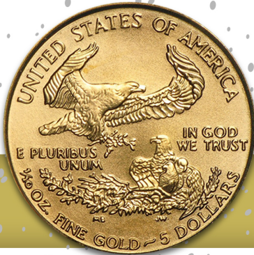
1/10 th oz American Gold Eagles